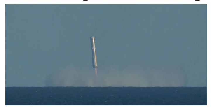
Starship's Super Heavy Flight 6 booster hovers over the Gulf of Mexico shortly before splashdown.

SpaceX's 400-foot-tall Starship mega-rocket lifted off for the sixth time on November 19 from the company's Starbase site in South Texas at 4:00 p.m. CST. Sadly, there was no "chopsticks" booster catch this time, one of the great engineering feats SpaceX has developed.