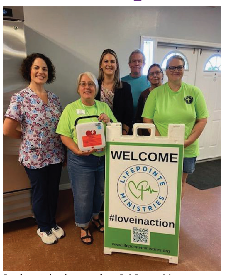
Leaders and volunteers from LifePointe Ministries pose with Parrish Healthcare Care Partners.

This initiative is a part of Parrish Healthcare's ongoing efforts to provide local organizations with the tools and knowledge needed to respond to emergencies and promote