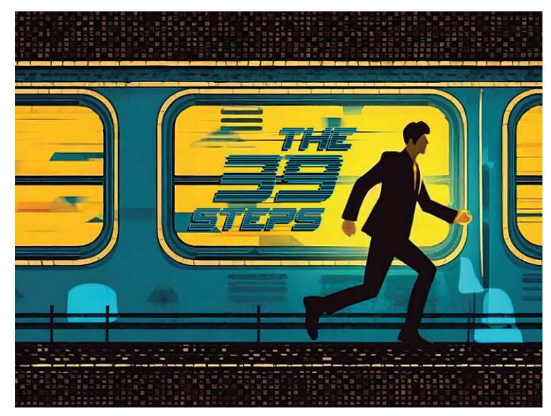
THE 39 STEPS April 4-20, 2025 Rated PG

To learn more about Pulsed Field Ablation and the other cardiovascular service advancements available at Parrish Healthcare, visit parrishhealthcare.com/cardiovascular or call 321-633-8660.