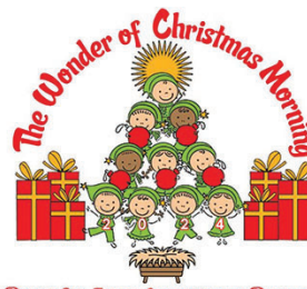
PORT ST. JOHN CHRISTMAS PARADE

The Port St. John Christmas Parade will be on Saturday, December 21, 11 a.m. and will travel east on Fay Blvd. from Waterloo Ave. to Carole Ave.