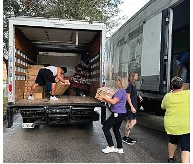
Members from Parrish Healthcare and North Brevard Charities load items for delivery.