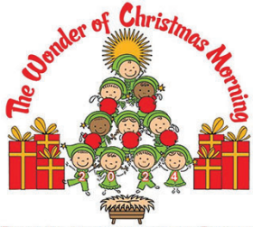
PORT ST. JOHN CHRISTMAS PARADE

Planning has begun for the 35th Annual Port St. John Christmas Parade. The parade will take place on December 21, 2024, 11 a.m. in Port St. John. The parade route will be east along Fay Blvd. from Waterloo Ave. to Carole Ave. We are planning for a larger parade, 70-80 entries this year.