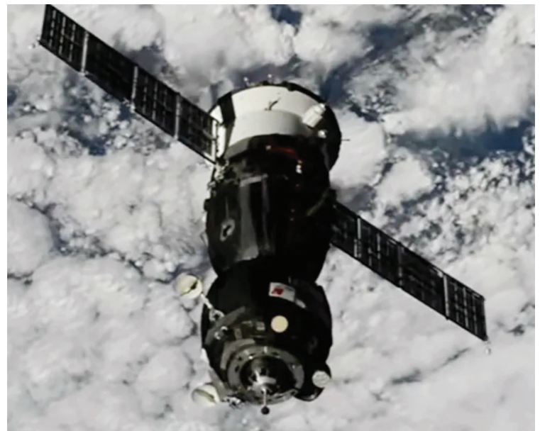
The Soyuz module approaches the ISS.

The three new arrivals will spend about eight months in orbit as members of the ISS's Expedition 72 and 73 missions. They'll return to Earth in December, if all goes according to plan.