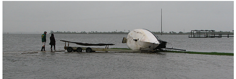
PSJ Boat Ramp - docks are underwater

Some 45 tornadoes were reported throughout the day, mostly in the central and eastern parts of the state, the National Weather Service said. They confirmed two tornadoes had hit ground in Brevard County. At least nine deaths have been reported in the state so far, and there's still a risk of more from flooding and/or homes that responders have been unable to reach yet.