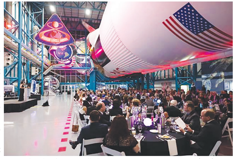
Dancing in the Moonlight was an enormous success thanks to an outpouring of support from every corner of the community.

Jess Parrish Medical Foundation's (JPMF) annual benefit gala Dancing in the Moonlight was a tremendous success, raising more than $125,000 in net proceeds to benefit the advancement of innovative healthcare technologies and services in support of the healing mission Parrish Healthcare. Presented by the law firm of Zumpano Patricios, the event was held October 5, at the Kennedy Space Center Visitor Complex's Apollo/ Saturn V Center.